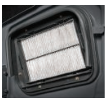
Fresh-air cab filter is quickly serviced from outside the cab, so it's more likely to get done.