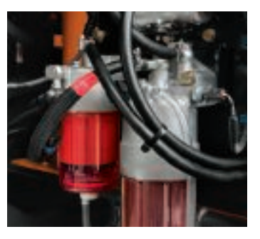
Vertical spin-on fuel- and engine-oil filters are positioned in the right rear compartment for simplified ground-level servicing.