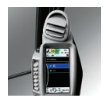
Automatic, high-velocity bi-level climate-control system with automotive-style adjustable louvers helps keep the glass clear, the cab comfortable, and the operator productive.